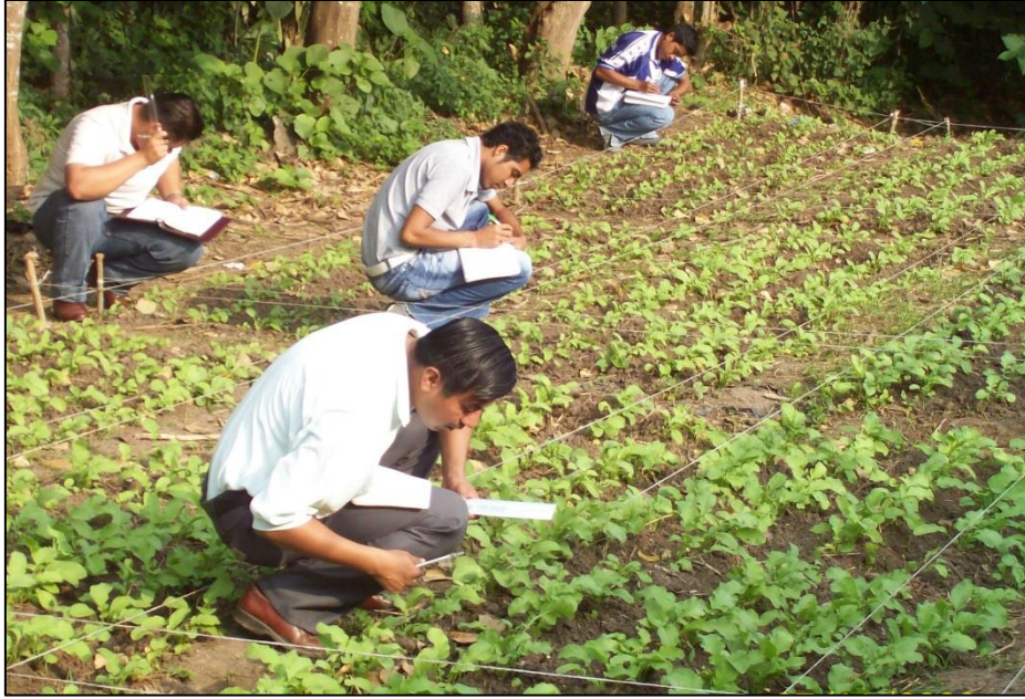
Figure 2. Scenarios metaskills learning and development for the scientific work of students studying agronomy IT Ursulo Galvan.

Unlike the various voices proclaiming the teaching and learning of science exclusively from solving problems through organizing teaching units articulated basically as collections of problems, selected with care and ordered in sequences that aim to achieve meaningful learning, assessments under testifying academic performance in the present proposal projected that students build a conception of the world closer to the conception that scientists have, which as already indicated lines back convenes the conceptual change and learning by investigation. Only in this case without resorting exclusively to counterexamples, simple falsification or cognitive dissonance, as used in these guidelines. The idea was to diversify strategies and use them to promote metacognition. It claimed that the teacher knew how scientific knowledge is constructed. That is, to make the learner develops the ability to observe, classify, compare, measure, describe coherently organizing information, predicting, making inferences and hypotheses, interpreting data, modeling, and draw conclusions, you must first know how to do the teacher. In the end no one gives what he has not.